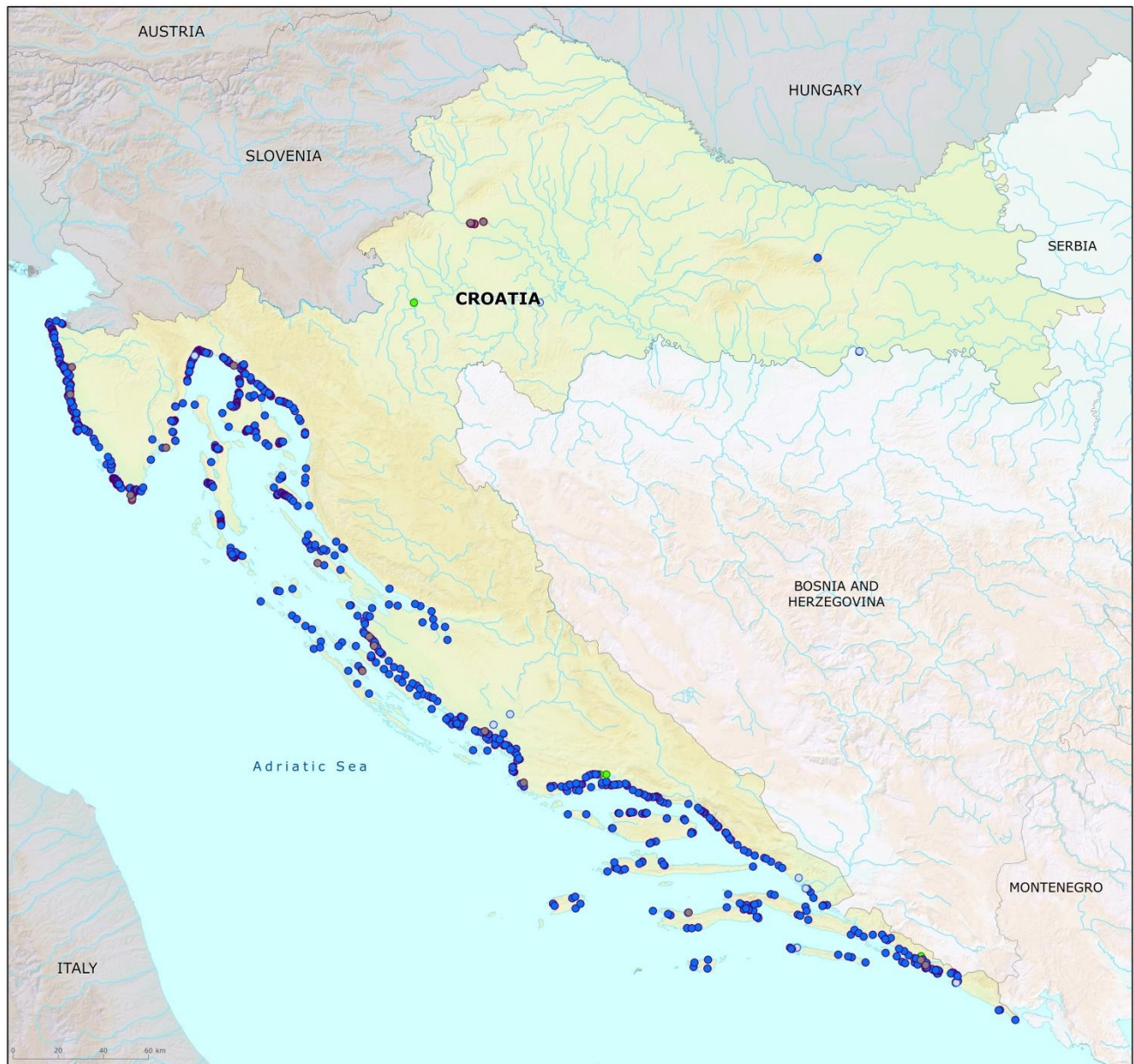
Map 1: Bathing waters reported during the 2016 bathing season in Croatia