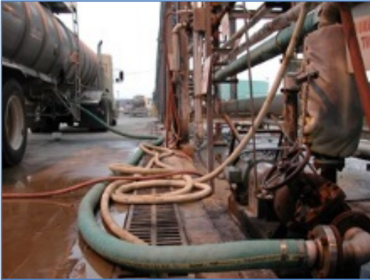
Figure 3: The truck loading and the collection drain

On January 16, 2002, highly toxic hydrogen sulphide ( H_2S ) gas leaked from a sewer manway at the Georgia-Pacific Naheola mill in Pennington, Alabama. Several people working near the manway were exposed to the gas. Two contract workers were killed and eight were injured. All of them were transported to hospitals reporting symptoms of hydrogen sulphide exposure. Apparently, NaSH from the tank truck unloading station was released to the acid sewer, where it inadvertently reacted with sulphuric acid to produce H_2S .